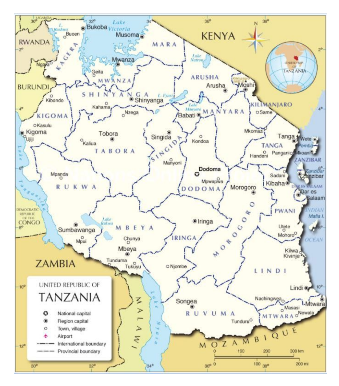
Figure 1: Map of Tanzania